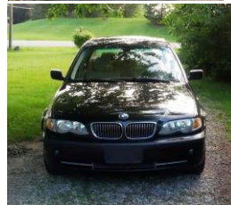
My E46 car