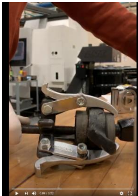
Control arm bushing replacement

I'm driven to design with the least impact on nature. My goal is to leave only footprints – ensuring every product respects and preserves the environment.